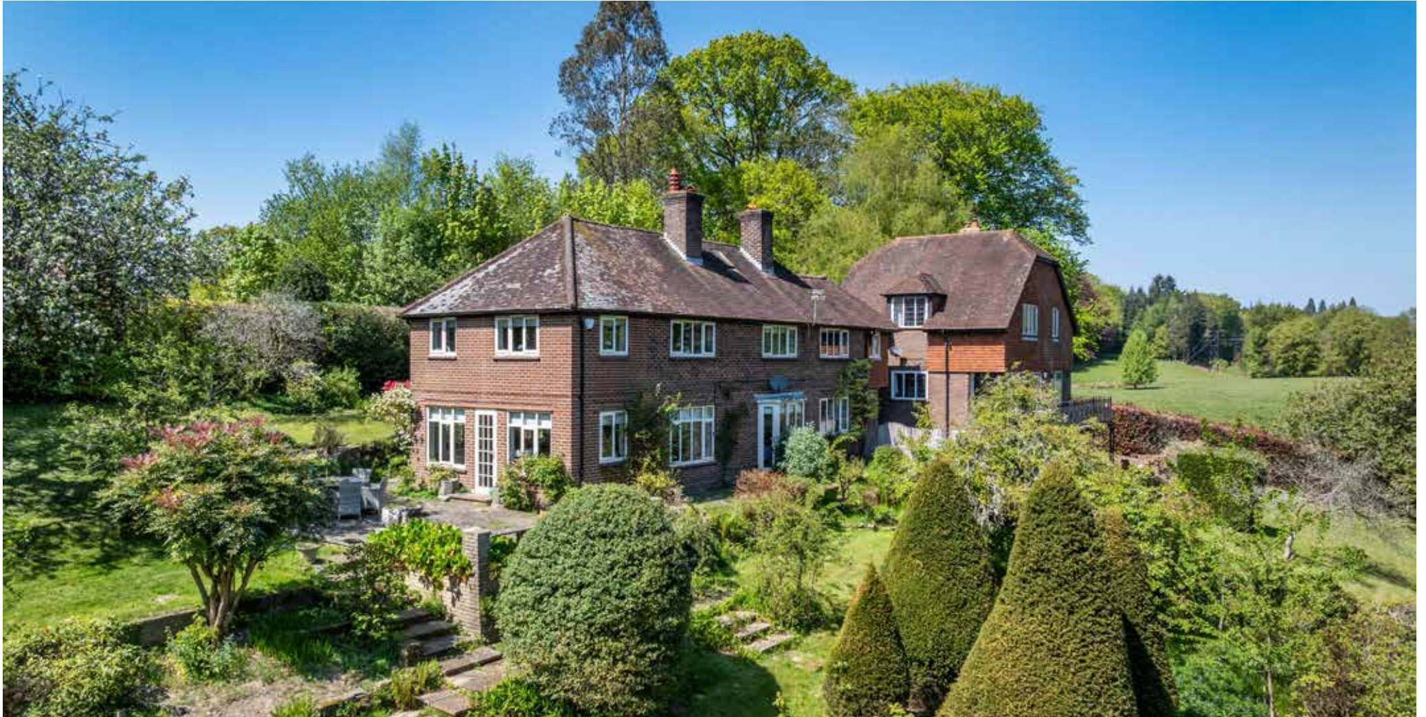
OLD ORCHARD, MARLEY HEIGHTS, HASLEMERE