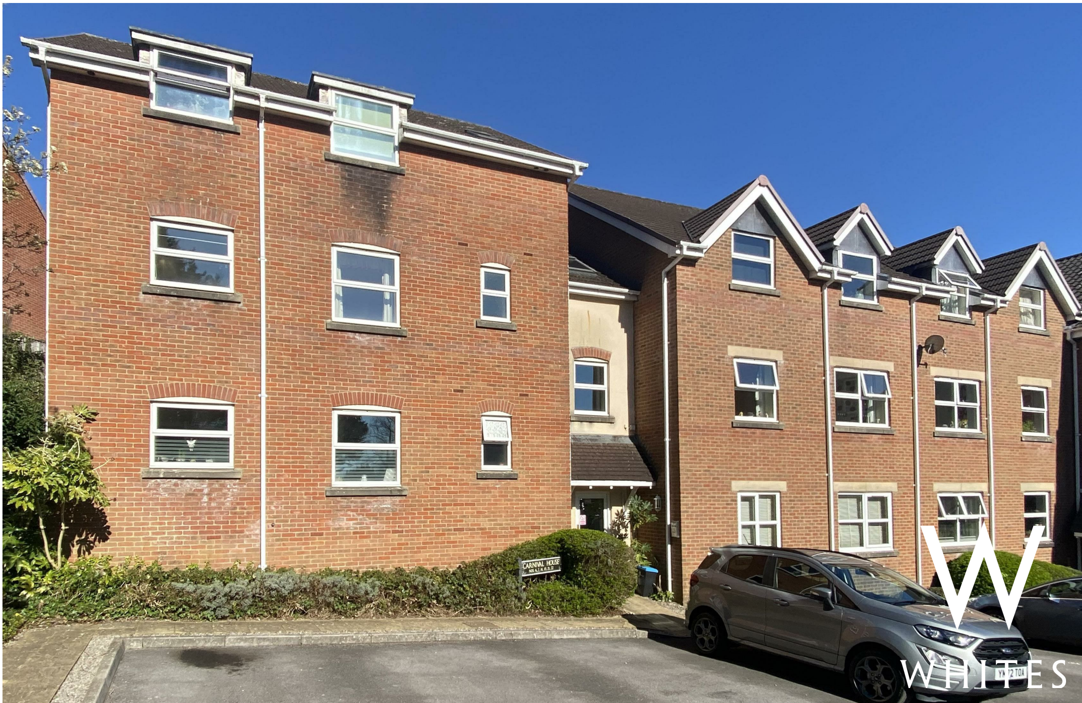
15 Carnival House, Jubilee Close, Salisbury, Wiltshire, SP2 9ER