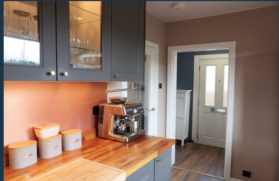
Extremely comfortable modern home in walk-into condition