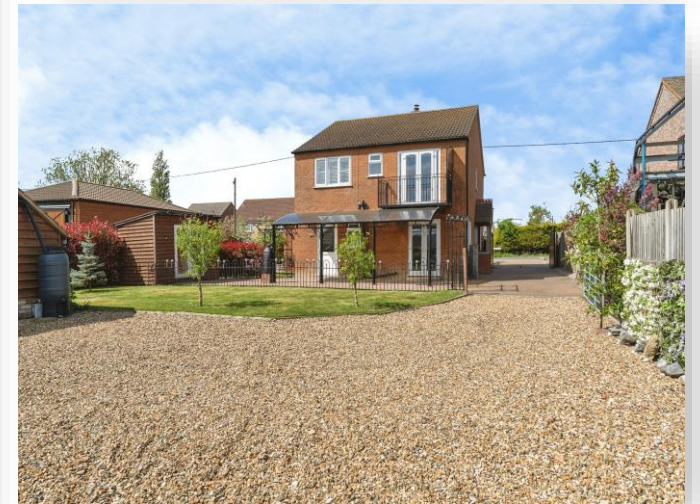
Station Road, Manea PE15 0HG