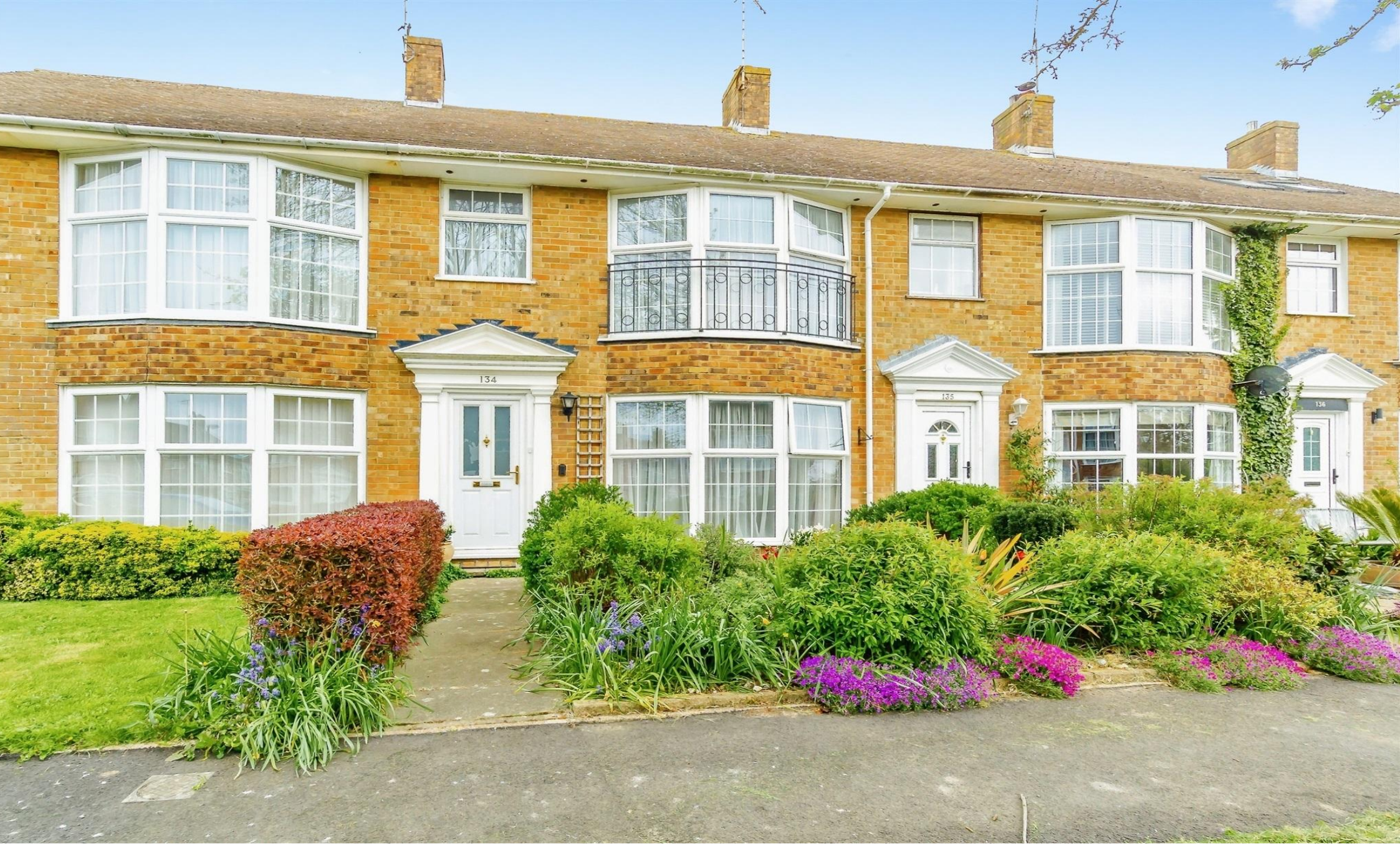
Greenacres, Shoreham-By-Sea BN43 5XL