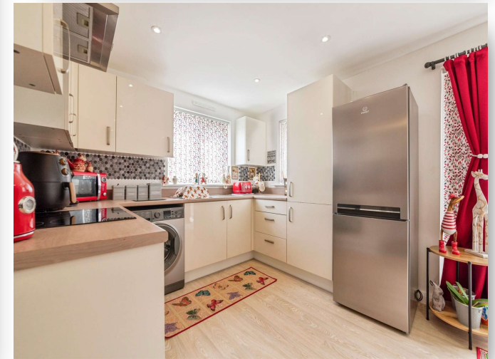
Gilberts Field, North Muskham Newark NG23 6NE