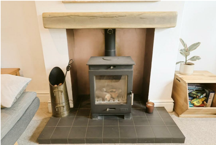
CAST IRON LOG BURNER

With wood grain effect laminate flooring, radiator, and recessed ceiling downlights. Stairs rise to the first floor, and a UPVC double-glazed door provides access to the rear garden. A light oak veneer door leads to the kitchen.