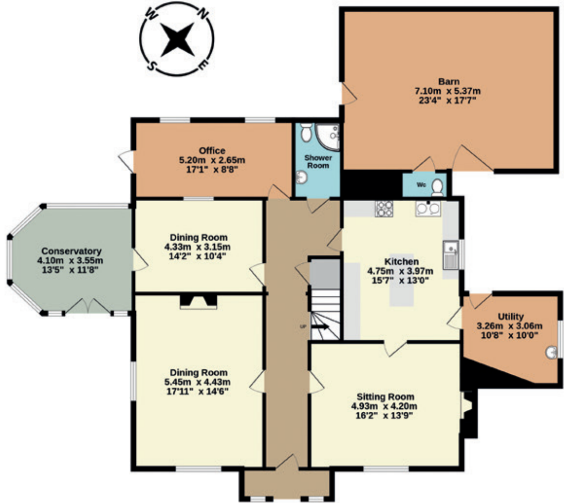
Ground Floor 179.6 sq.m. (1933 sq.ft.) approx.