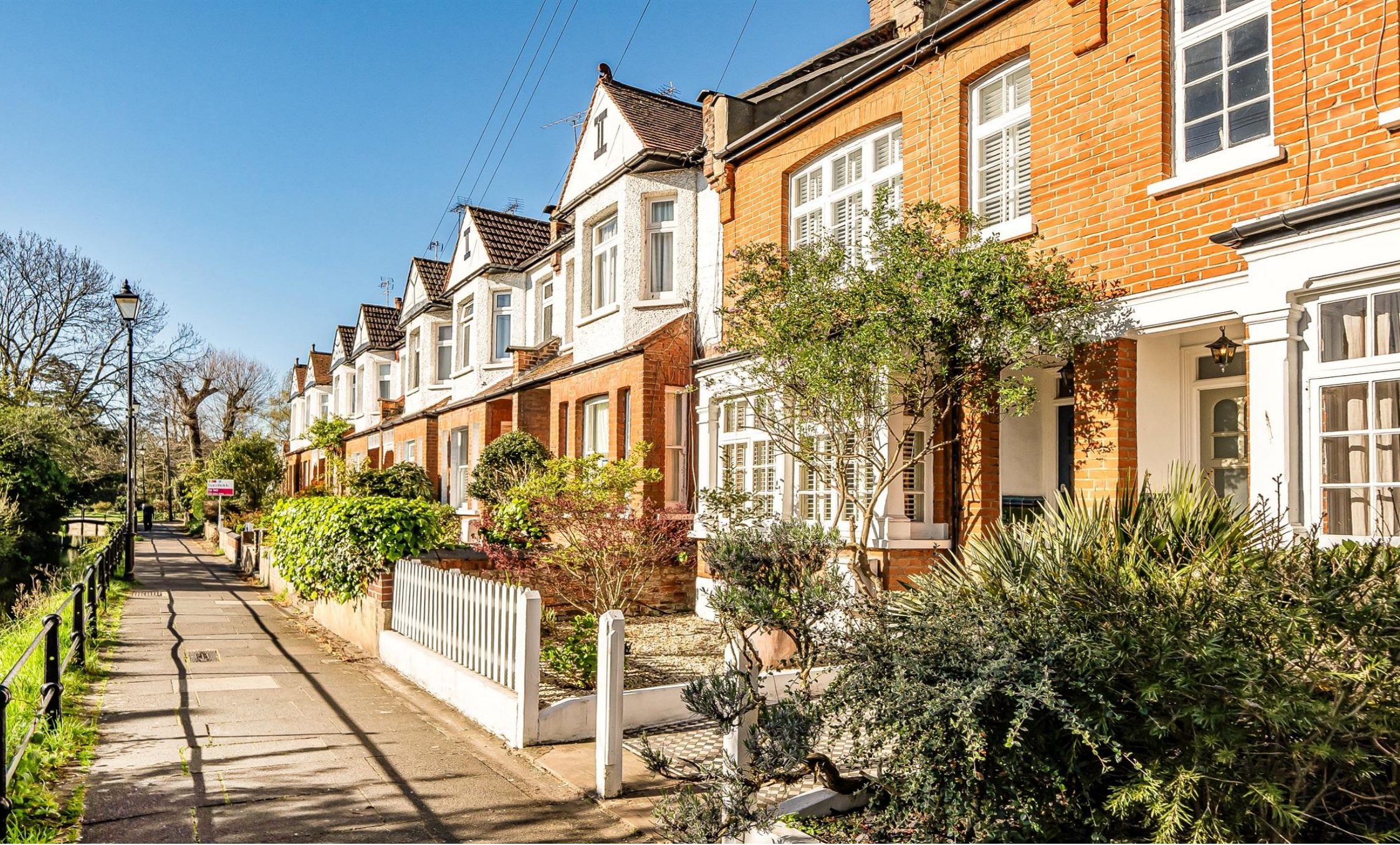
River View, Enfield, EN2 6PX