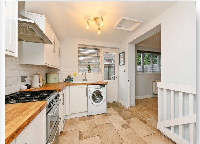
Iveagh Close, Dersingham, PE31 6YH