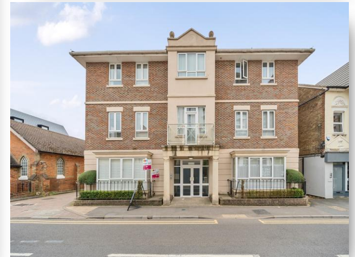
Flat 13 Shelley House, 2-4 York Road, Maidenhead SL6 1SF