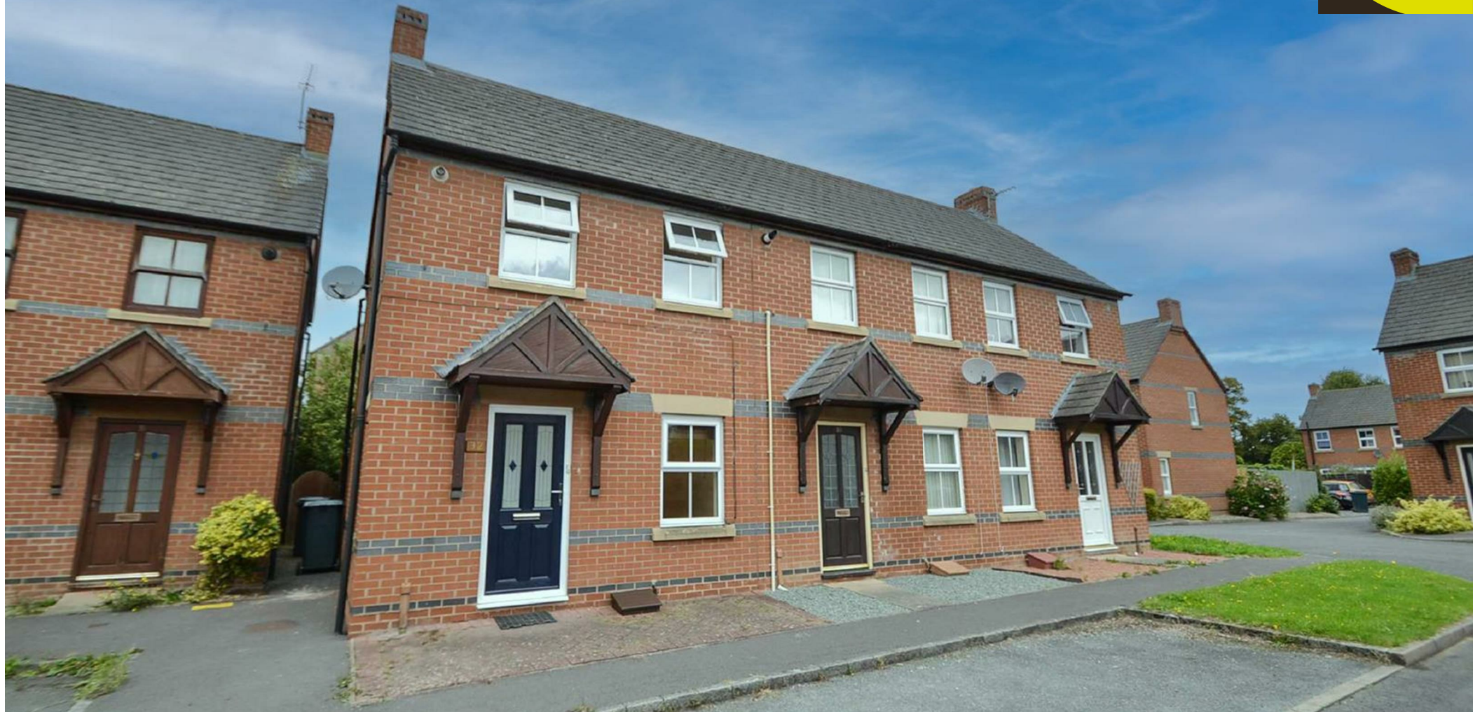
32, Glendower Court, Greenfields, Shrewsbury, SY1 2RG £850 Per Month