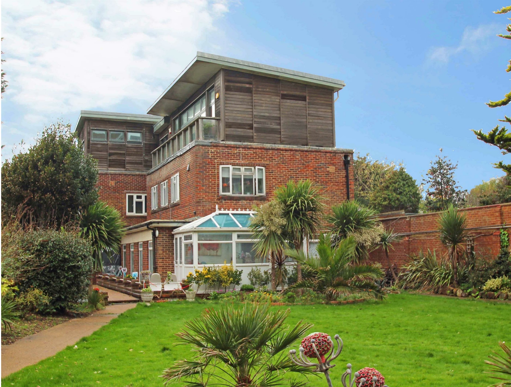
Viceroy Lodge, Kingsway, Hove, BN3 4RB £190,000