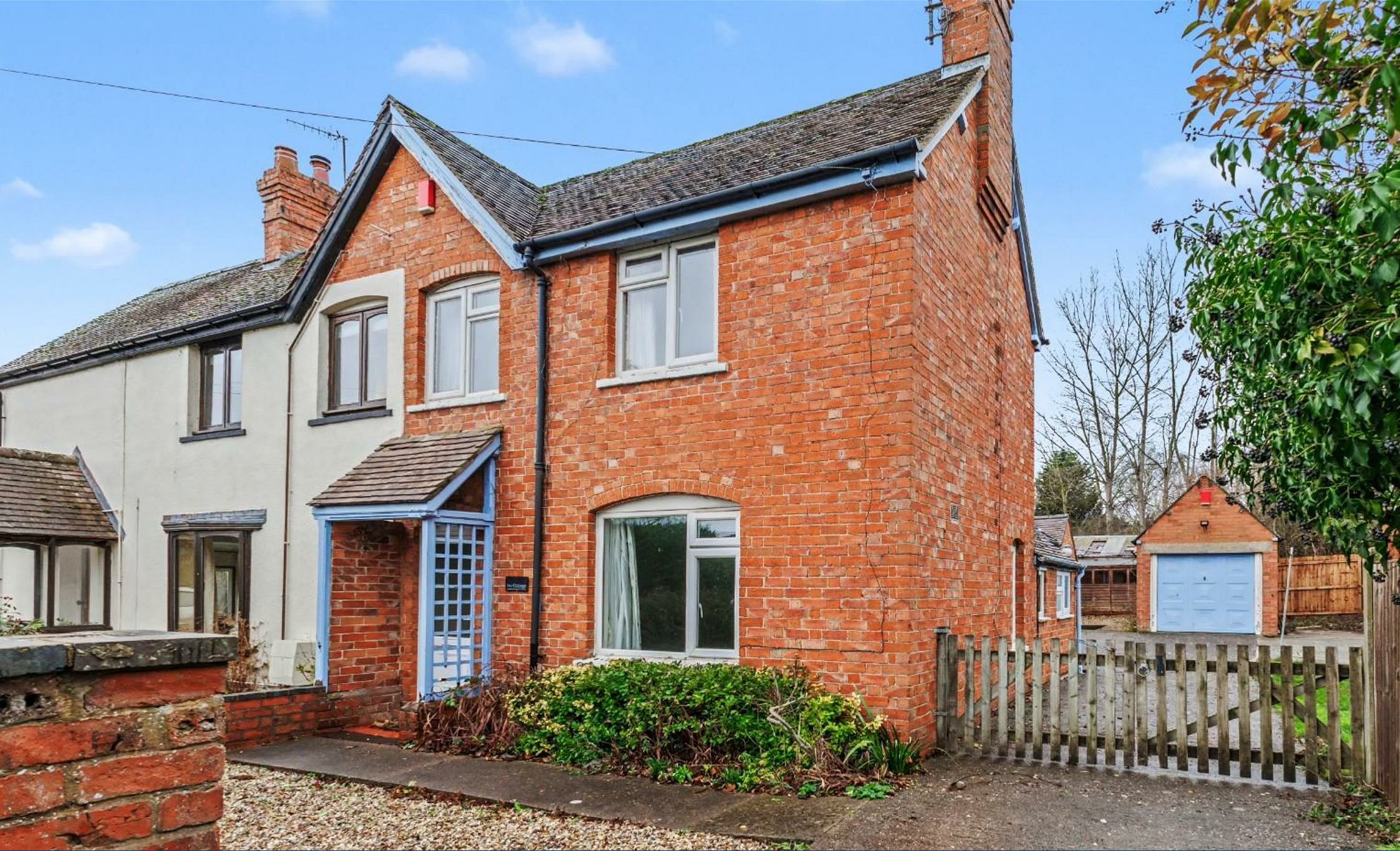
Ivy Cottage, Cleeve Road, Middle Littleton, Evesham, WR11 8JR