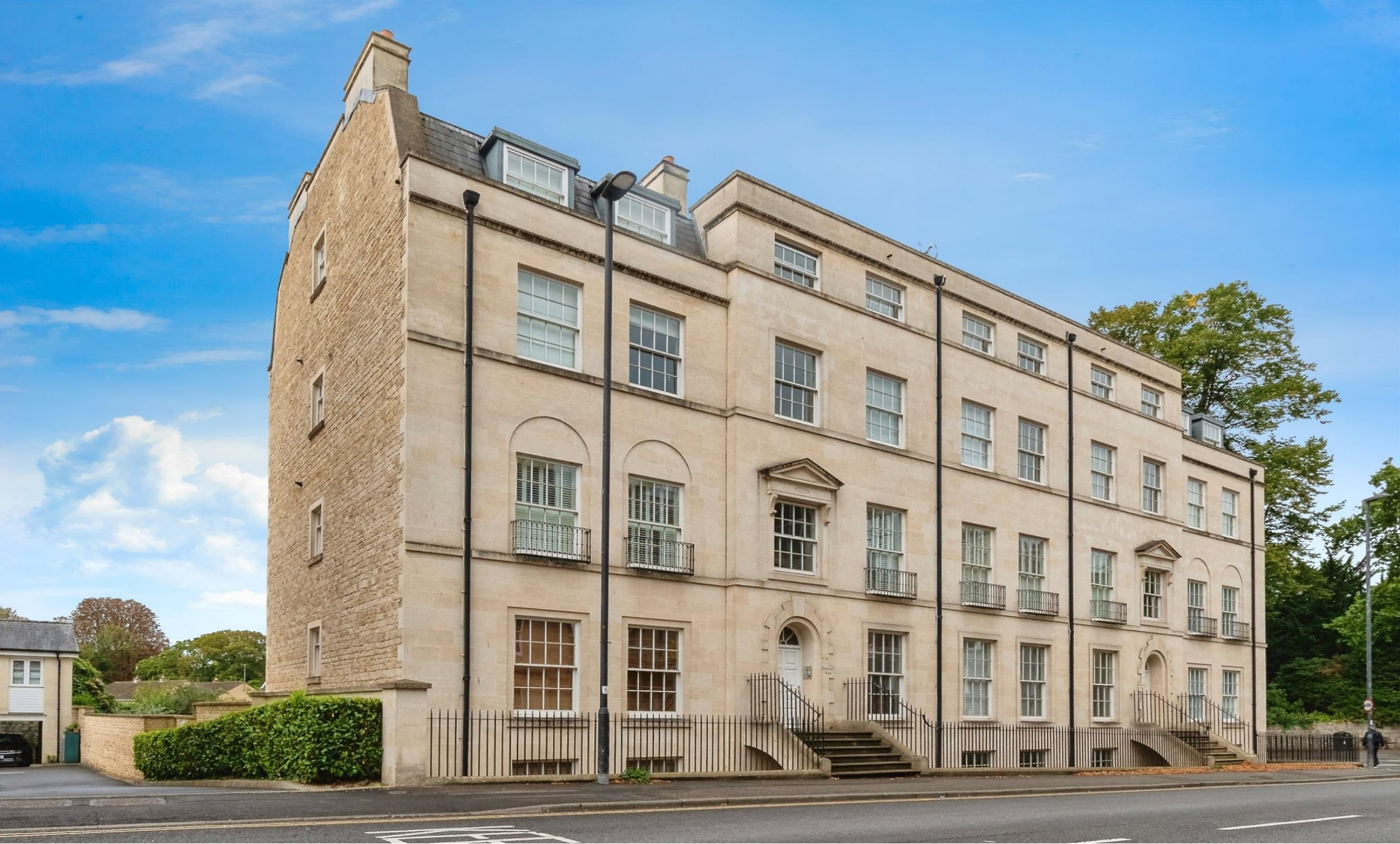
Holburne Place, Bath BA2 6LY