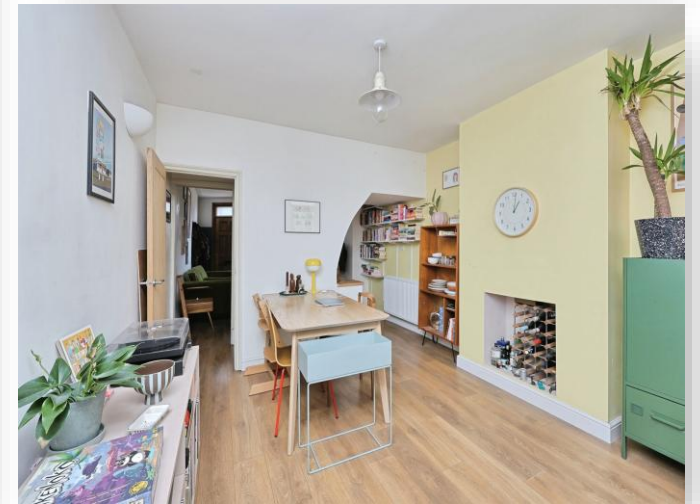
Spencer Street, Norwich, NR3 4PA