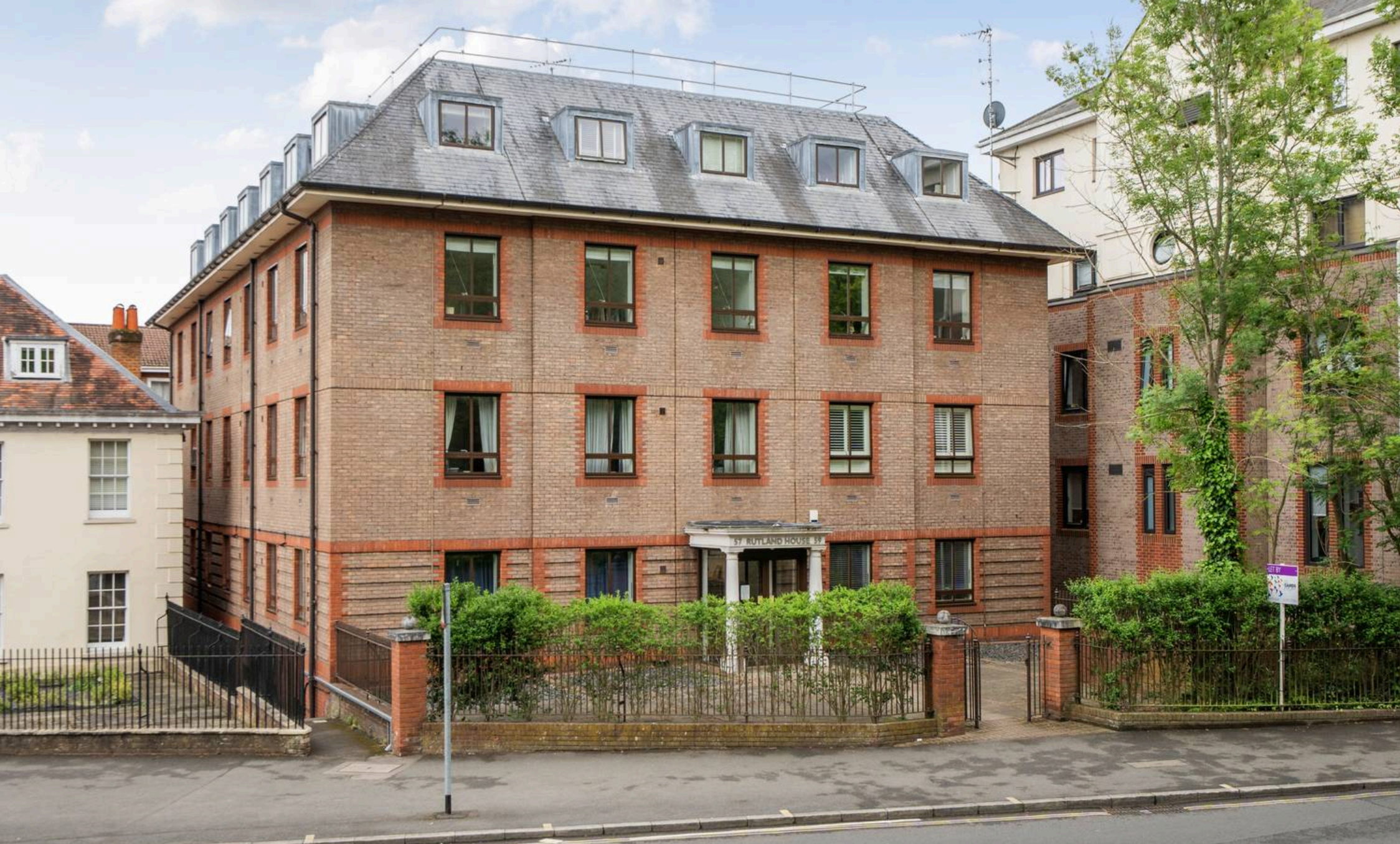
Rutland House, 57-59 South Street, Epsom