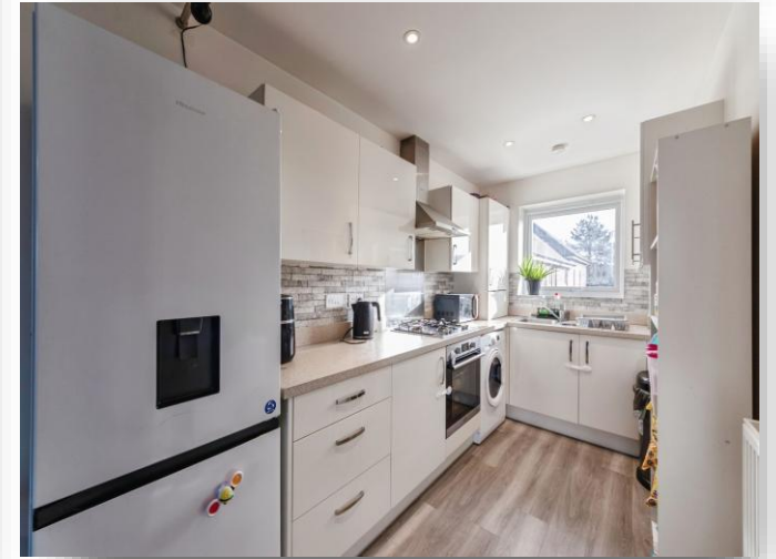
Victoria Crescent, Shirley SOLIHULL B90 2FG