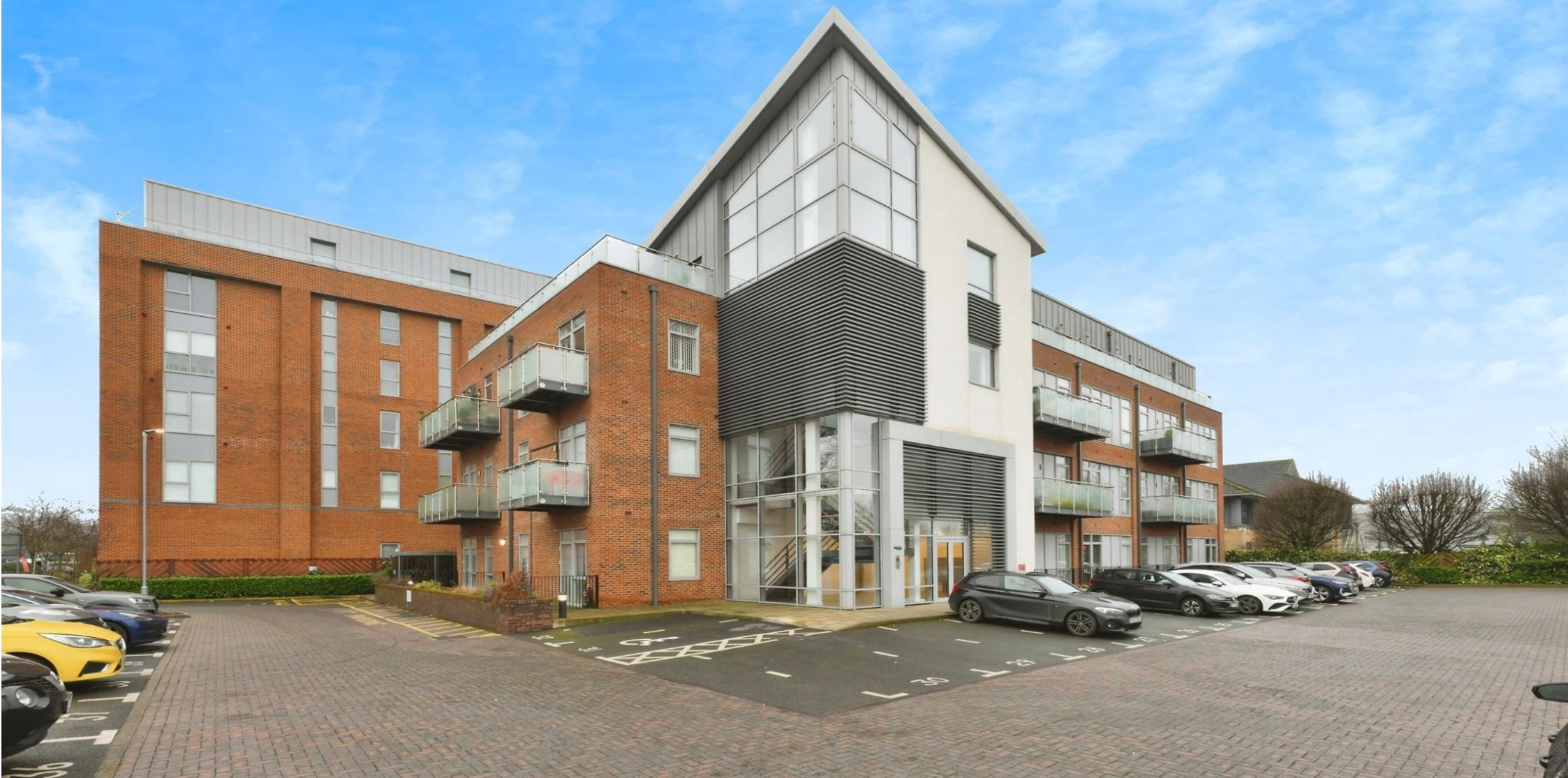
Mercury House Broadwater Road, WELWYN GARDEN CITY AL7 3FB