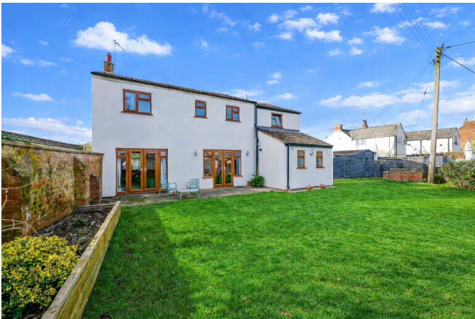
6 Kents Lane, Ettington, Stratford-upon-avon, CV37 7SJ