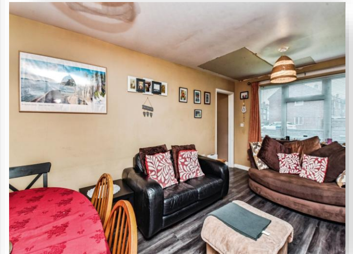
Mayenne Place, DEVIZES SN10 1QJ