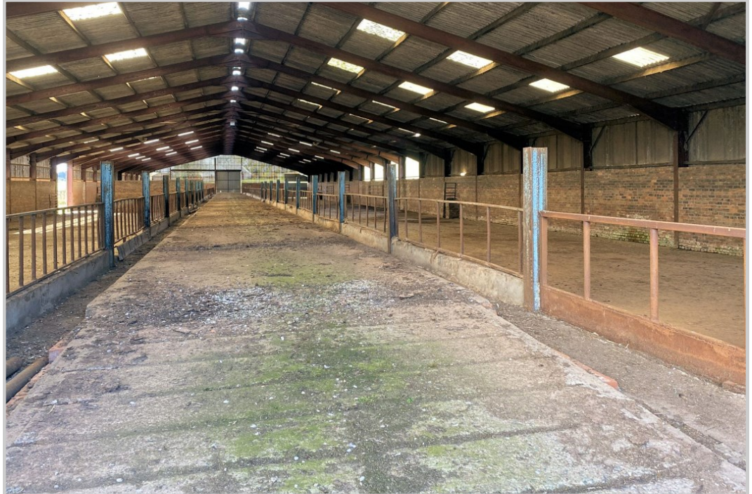
These particulars are believed to be correct, but their accuracy is not guaranteed and they do not form part of any contract. All measurements are approximate only.