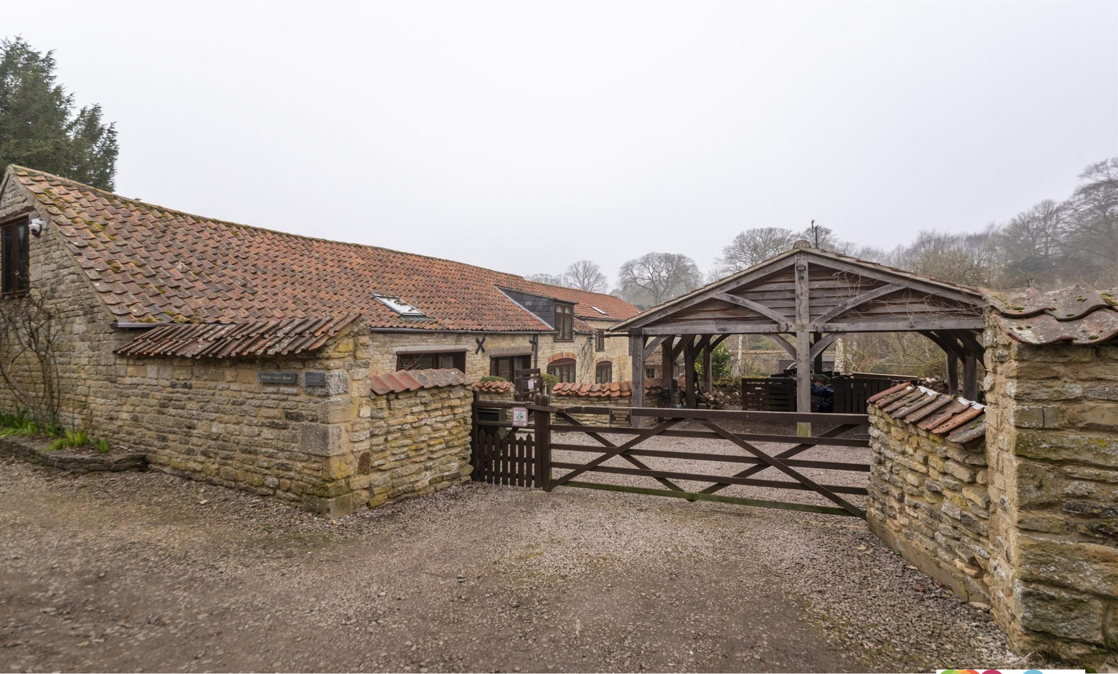
Bishops Coach House, Stoke Rochford, GRANTHAM NG33 5EB