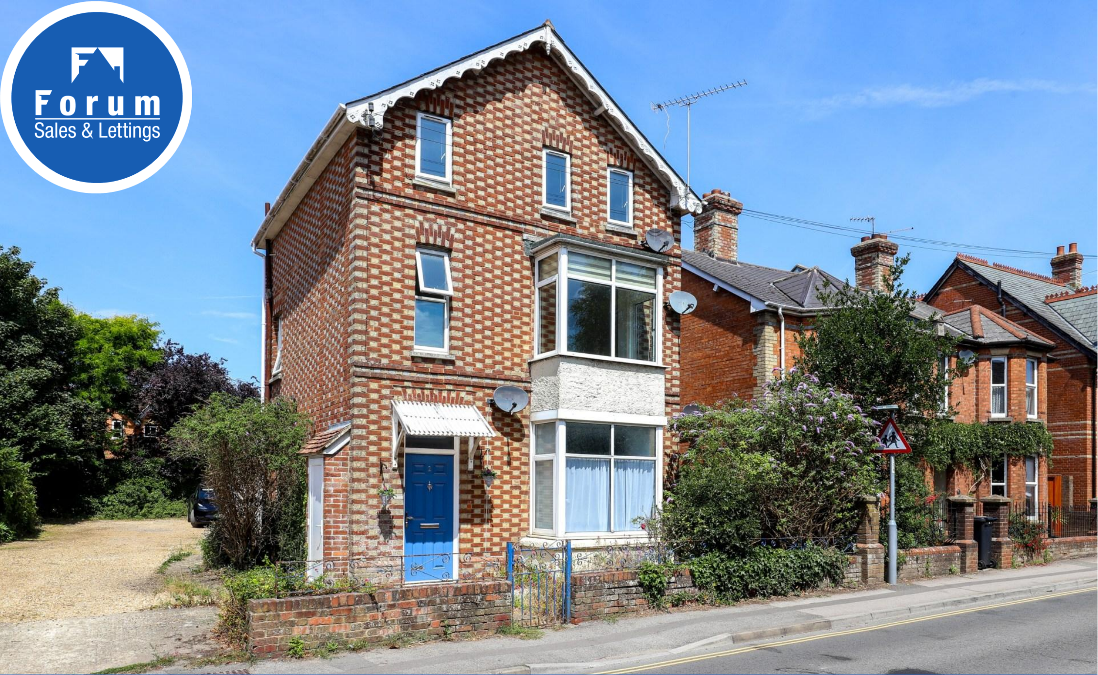
Flat 3, 2 Salisbury Road, Blandford Forum, Dorset, DT11 7QH