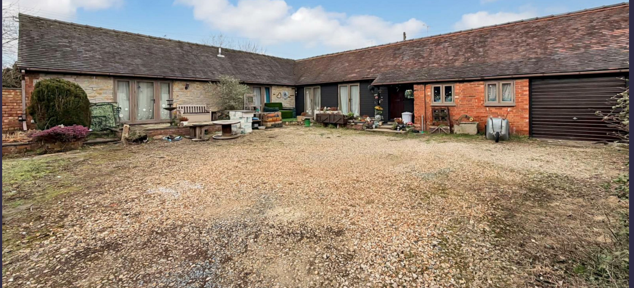
The Long Byre Pillerton Hersey, Warwick, CV35 0QA