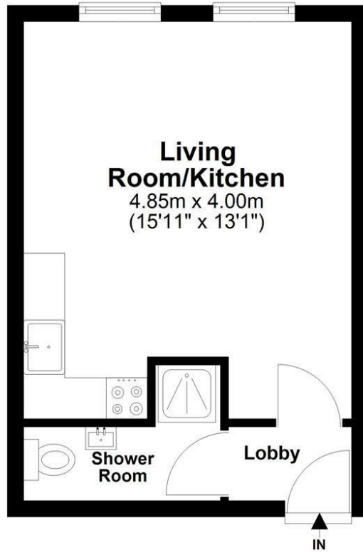
Illustration for identification purposes only; measurements are approximate, not to scale. www.fpusketch.co.uk Plan produced using PlanUp.

Approx Gross Internal Area 23.4 sqm / 251.9 sqft