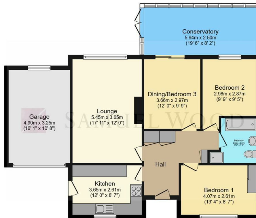
Floor Plan Floor area 109.4 sq.m. (1,178 sq.ft.)

Total floor area: 109.4 sq.m. (1,178 sq.ft.)