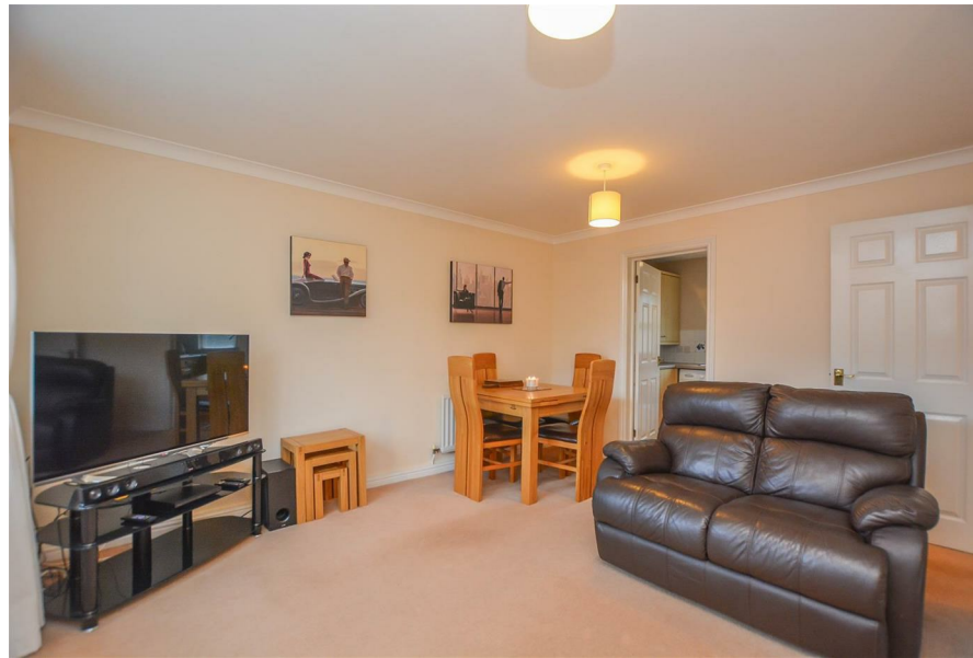
59 Bramble Tye, Laindon, Basildon, SS15 5GR

**Guide Price £225,000 - £235,000** We are delighted to present this well-proportioned two-bedroom first floor apartment, ideally situated on a pleasant residential street in the ever-popular Noak Bridge area. Offered with no onward chain, the property boasts thoughtfully arranged accommodation and the added advantage of two allocated parking spaces.