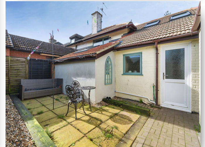
Old Hall Cottages Flixton Road, Flixton Lowestoft NR32 5PD