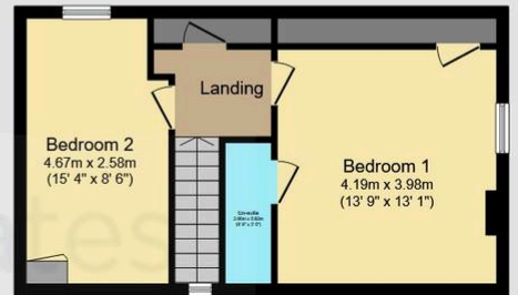
First Floor Floor area 37.1 sq.m. (399 sq.ft.)

Total floor area: 156.4 sq.m. (1,683 sq.ft.)