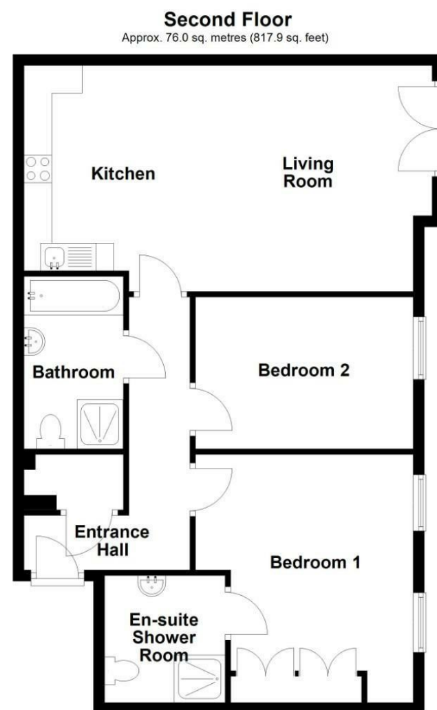
Total area: approx. 76.0 sq. metres (817.9 sq. feet)