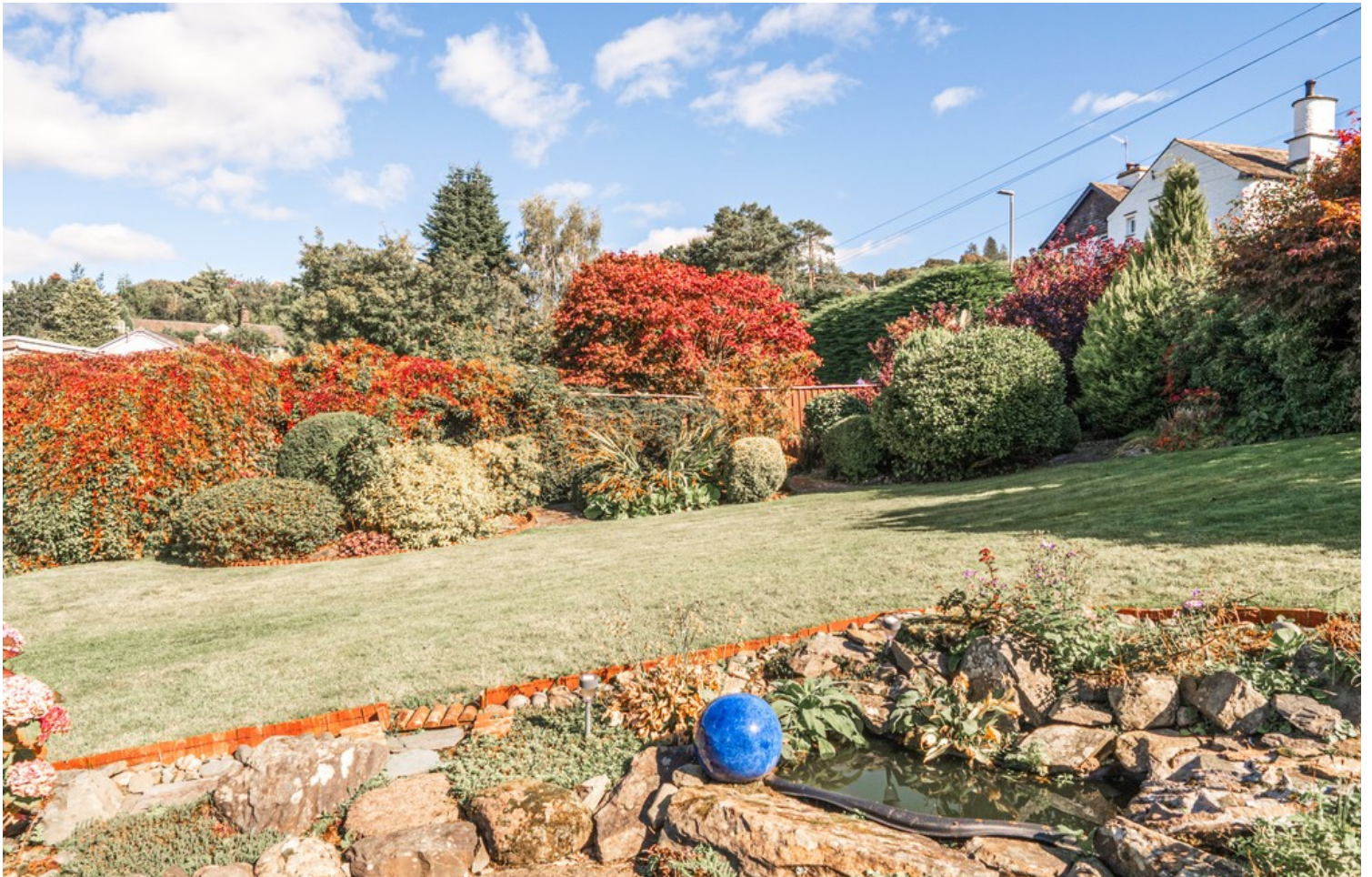
Pond & rear garden