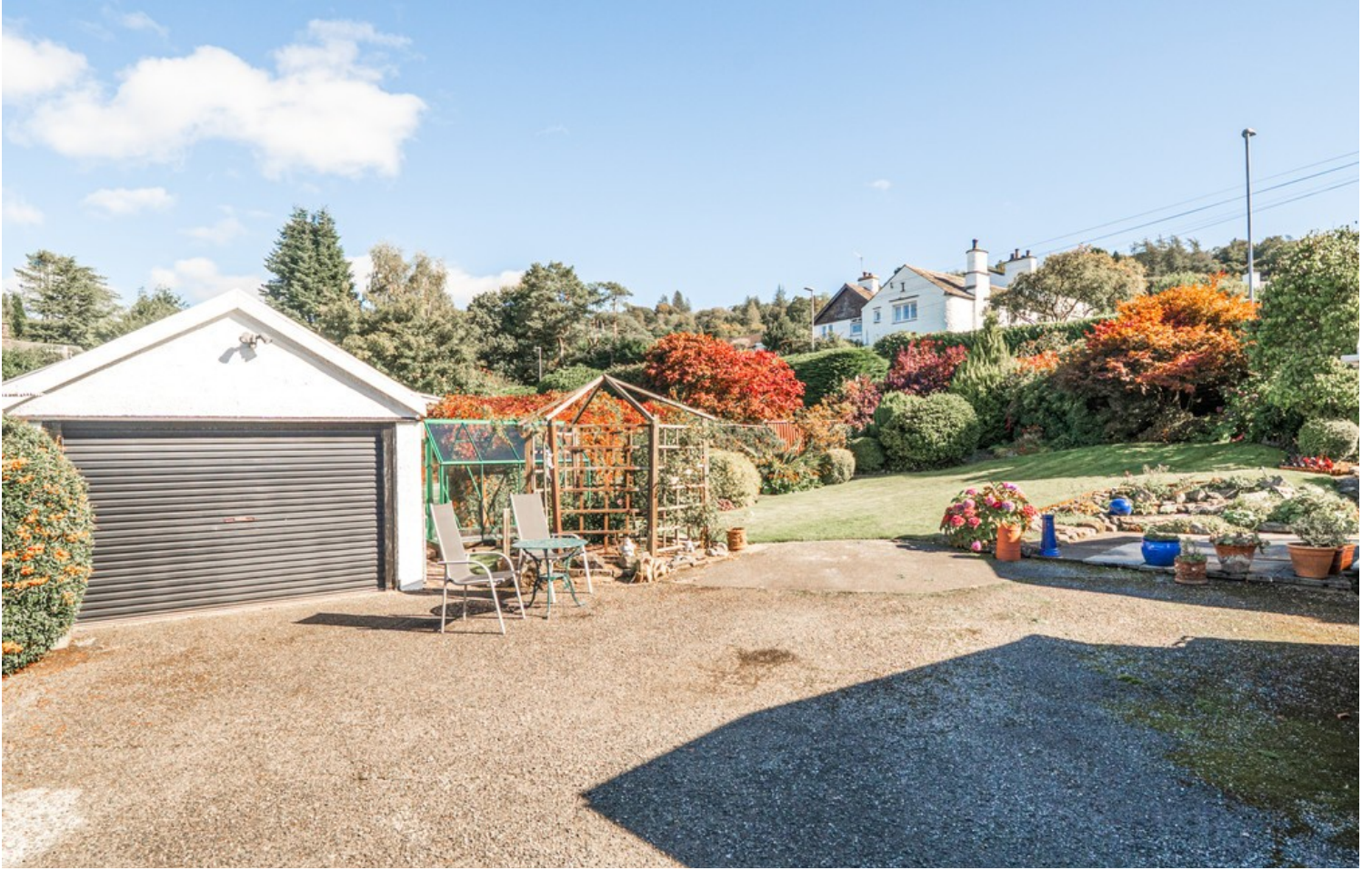
Garage & Parking for several cars