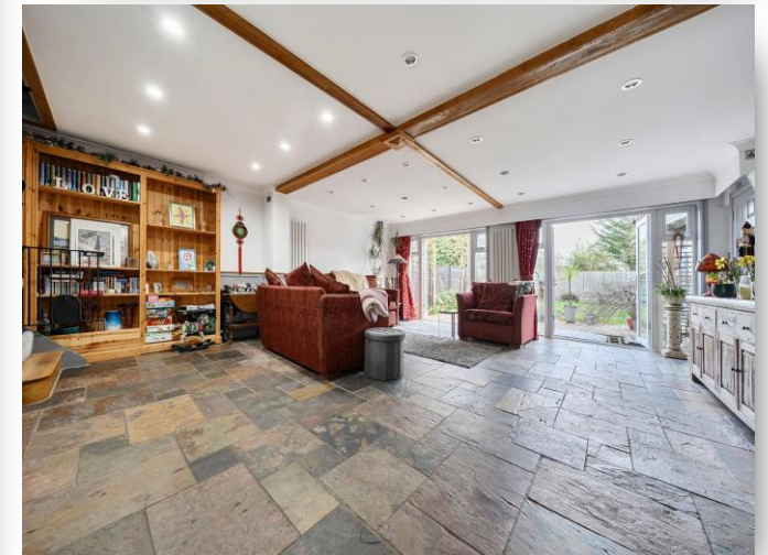
9 Juniper Drive, Maidenhead SL6 8RE