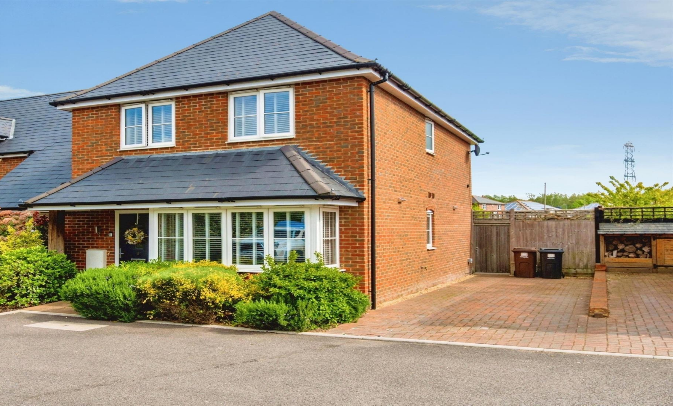
Blacksmith Cottages, Nursling Street, Nursling, SO16 0YA