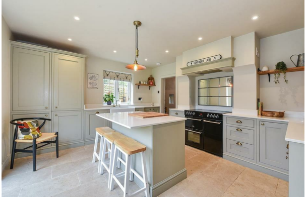
Popes Cottage Brook | £875,000 Lyndhurst, Hampshire, SO43 7HE