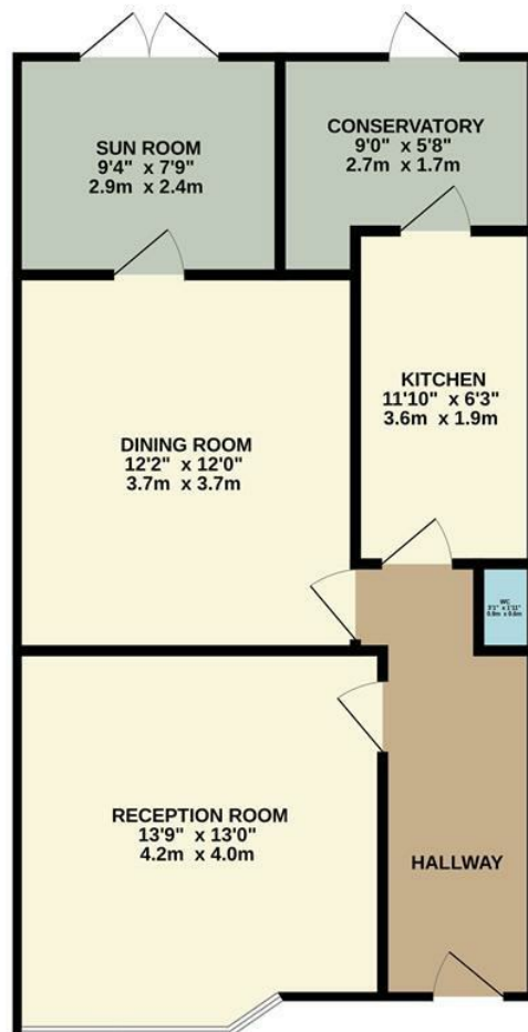
GROUND FLOOR 623 sq.ft. (57.9 sq.m.) approx.