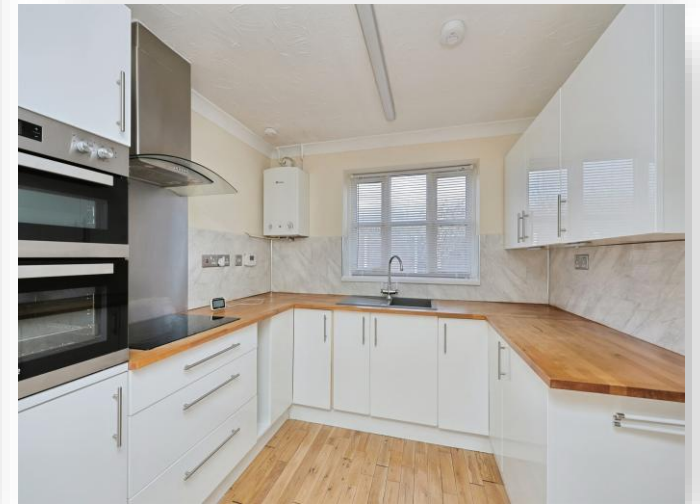
Hunters Oak, Watton Thetford IP25 6HL