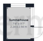
Ground Floor Building 3