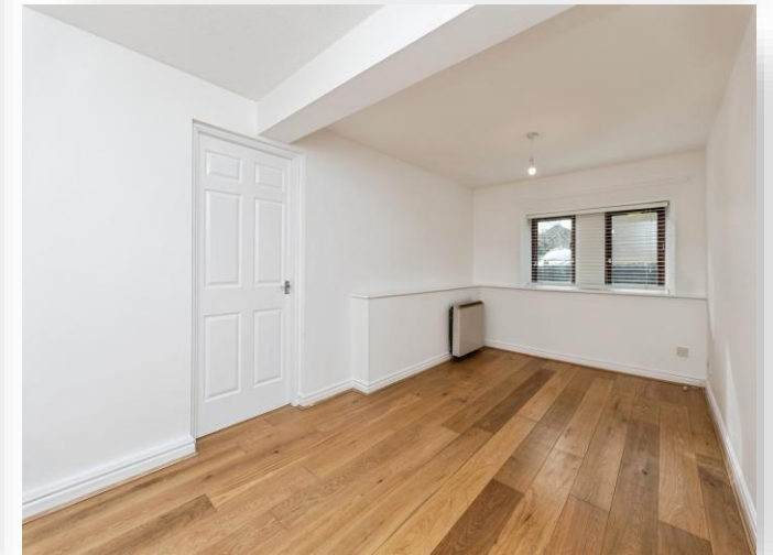
Fountain Hall Fountain Street, Morley Leeds LS27 0RA