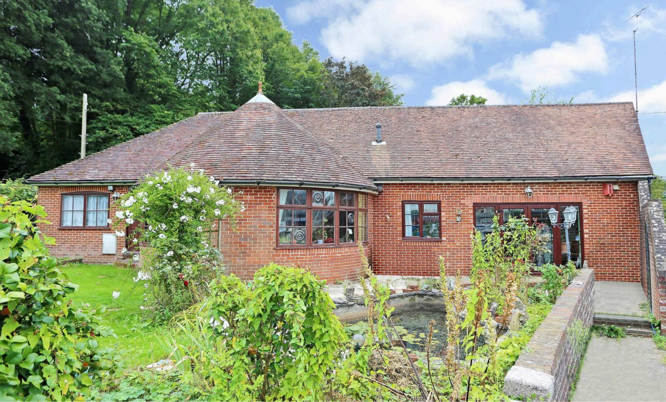
Grove Lodge, Eling Hill, Totton, Southampton, SO40 9HF £380,000