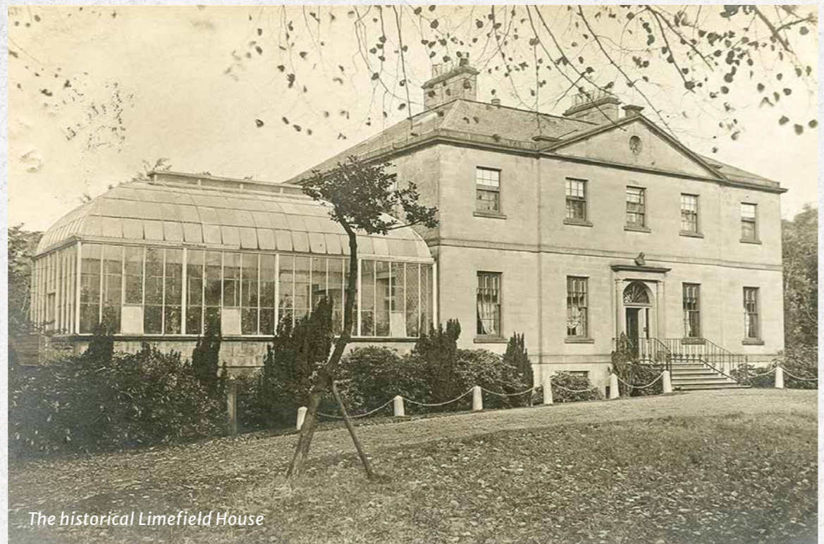
The historical Limefield House