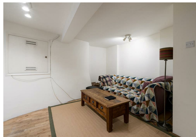
Reception Room 12'9" x 17'9"