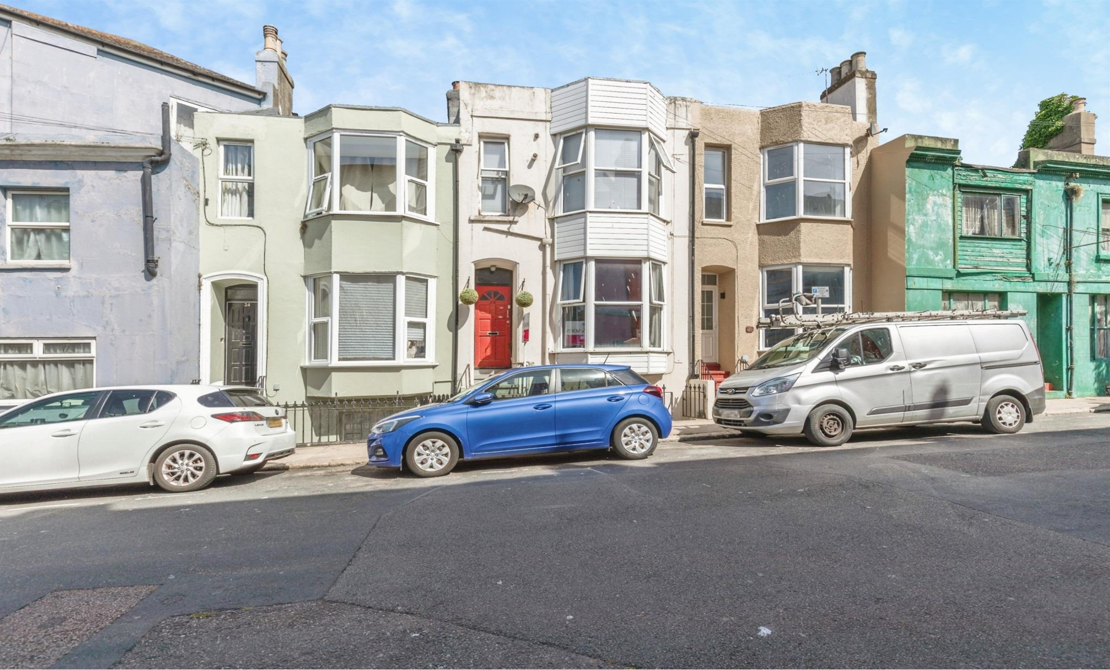
Cornwallis Street, Hastings TN34 1SS