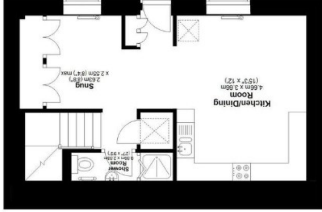
Ground Floor Main area: approx. 38.6 sq. metres (415.5 sq. feet) Plus outbuildings, approx. 5.0 sq. metres (56.6 sq. feet)