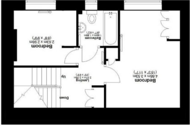
First Floor Approx: 36.9 sq. metres (397.7 sq. feet)