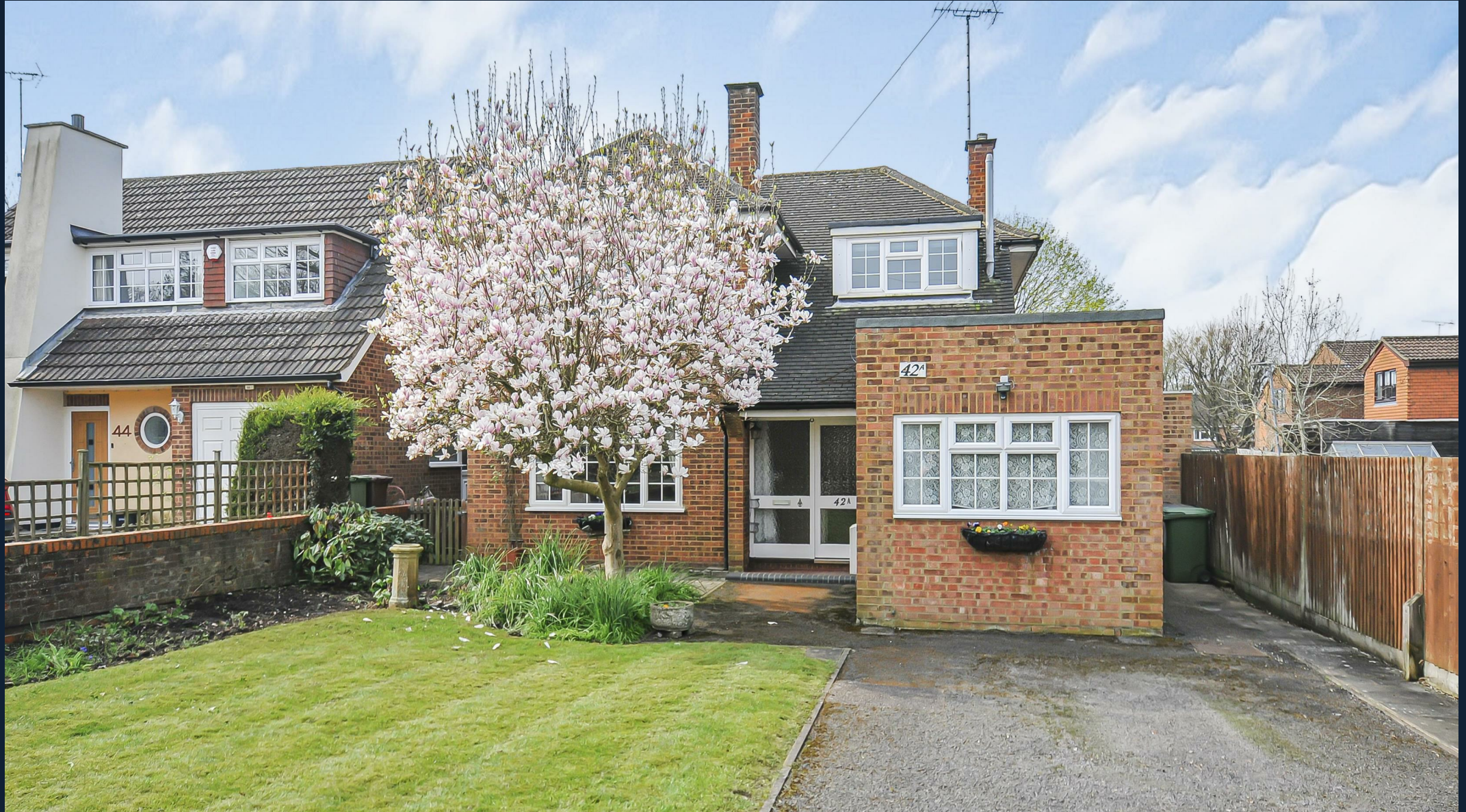
42a Oakwood Road, Bricket Wood, St. Albans, AL2 3PX Guide Price £775,000