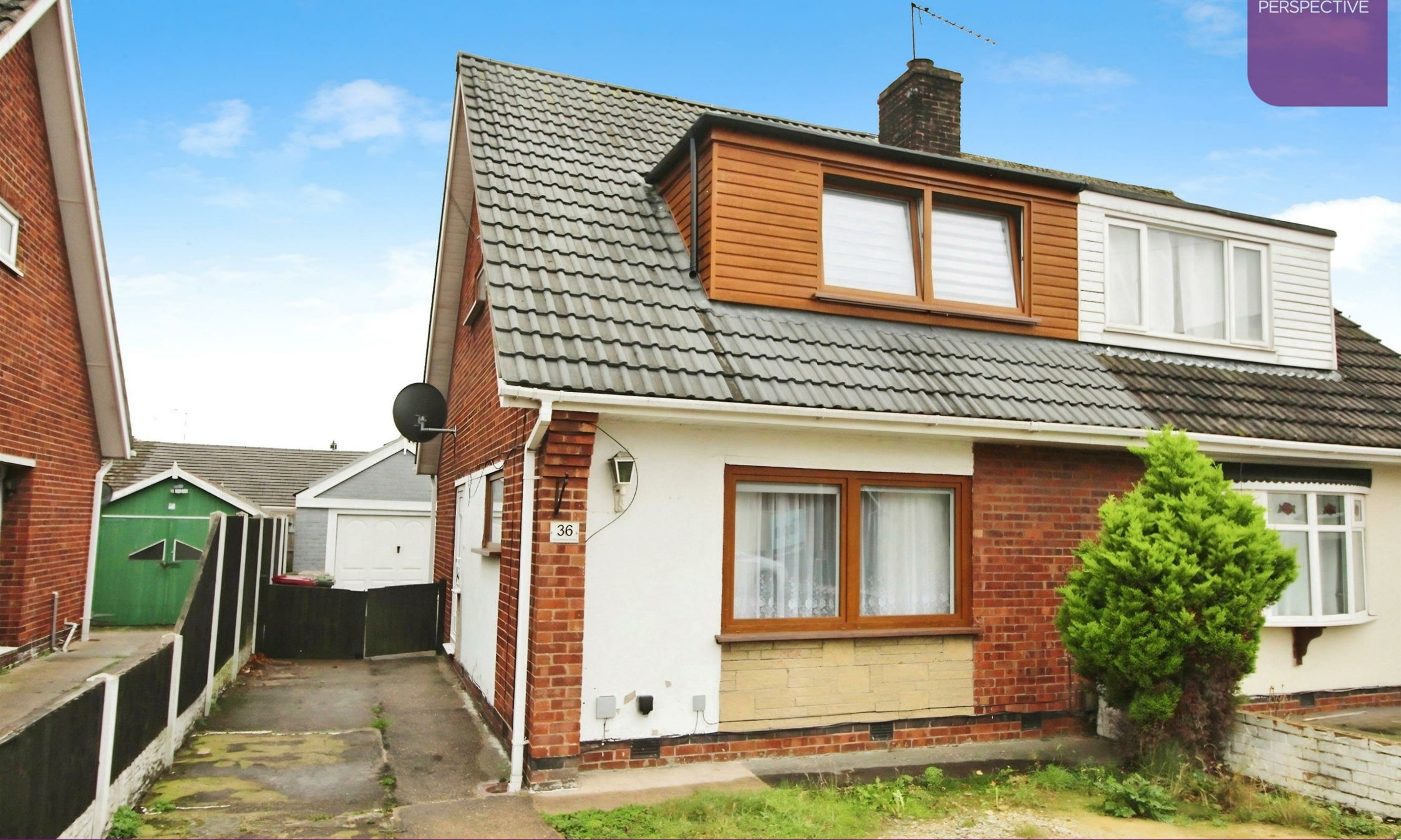
36 Woodclose Road, Scunthorpe, DN17 1RU £119,995