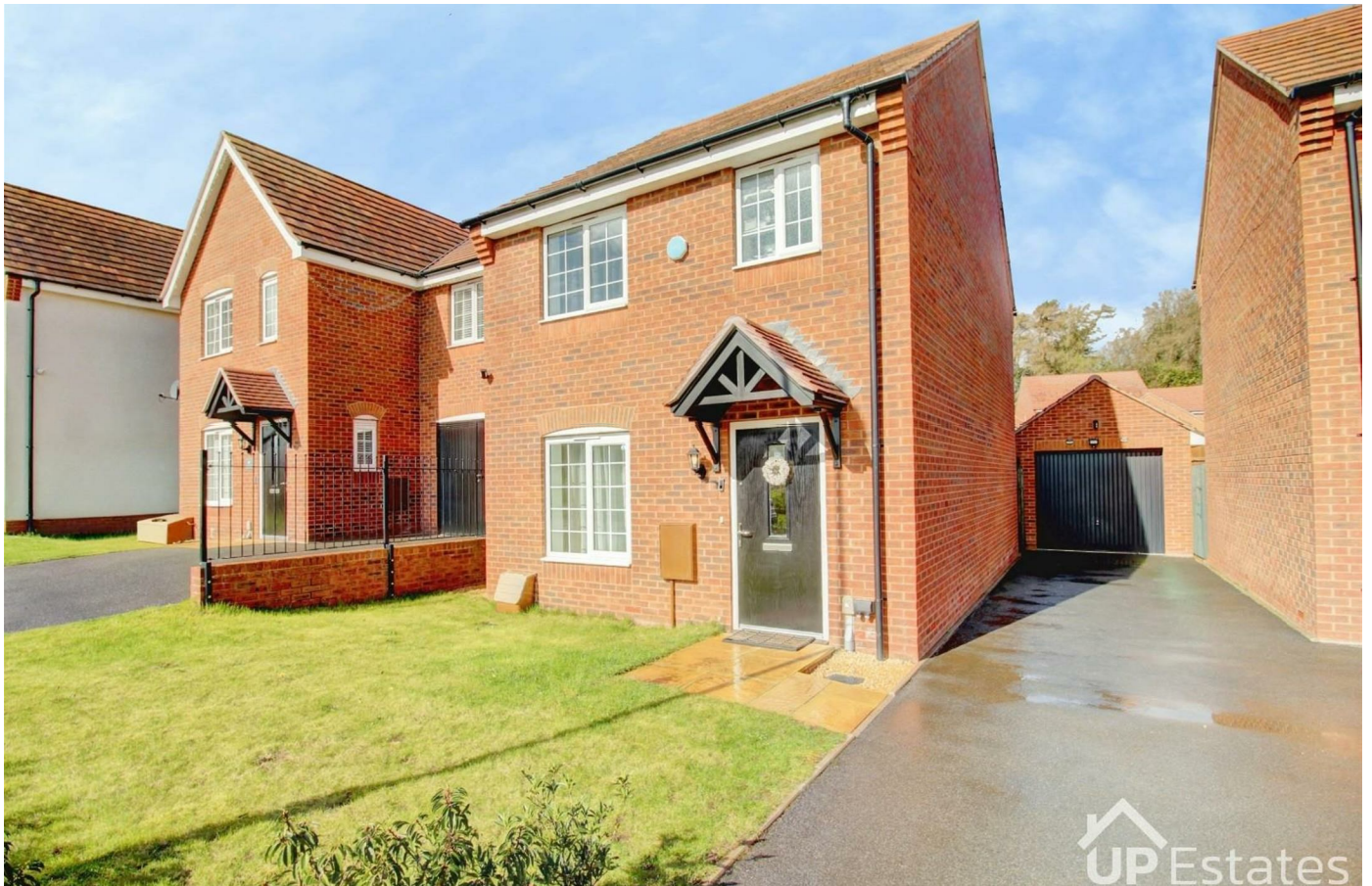
Henry Baxter Drive, Keresley End