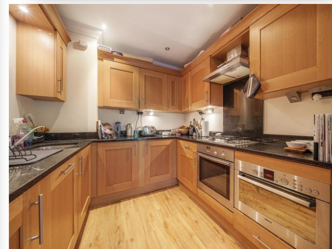
Flat 17 Fairway, Shoppenhangers Road, Maidenhead SL6 2PZ