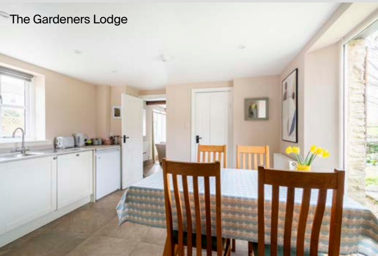
The Gardeners Lodge