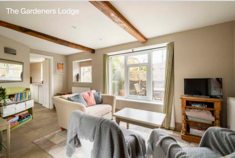
The Gardeners Lodge