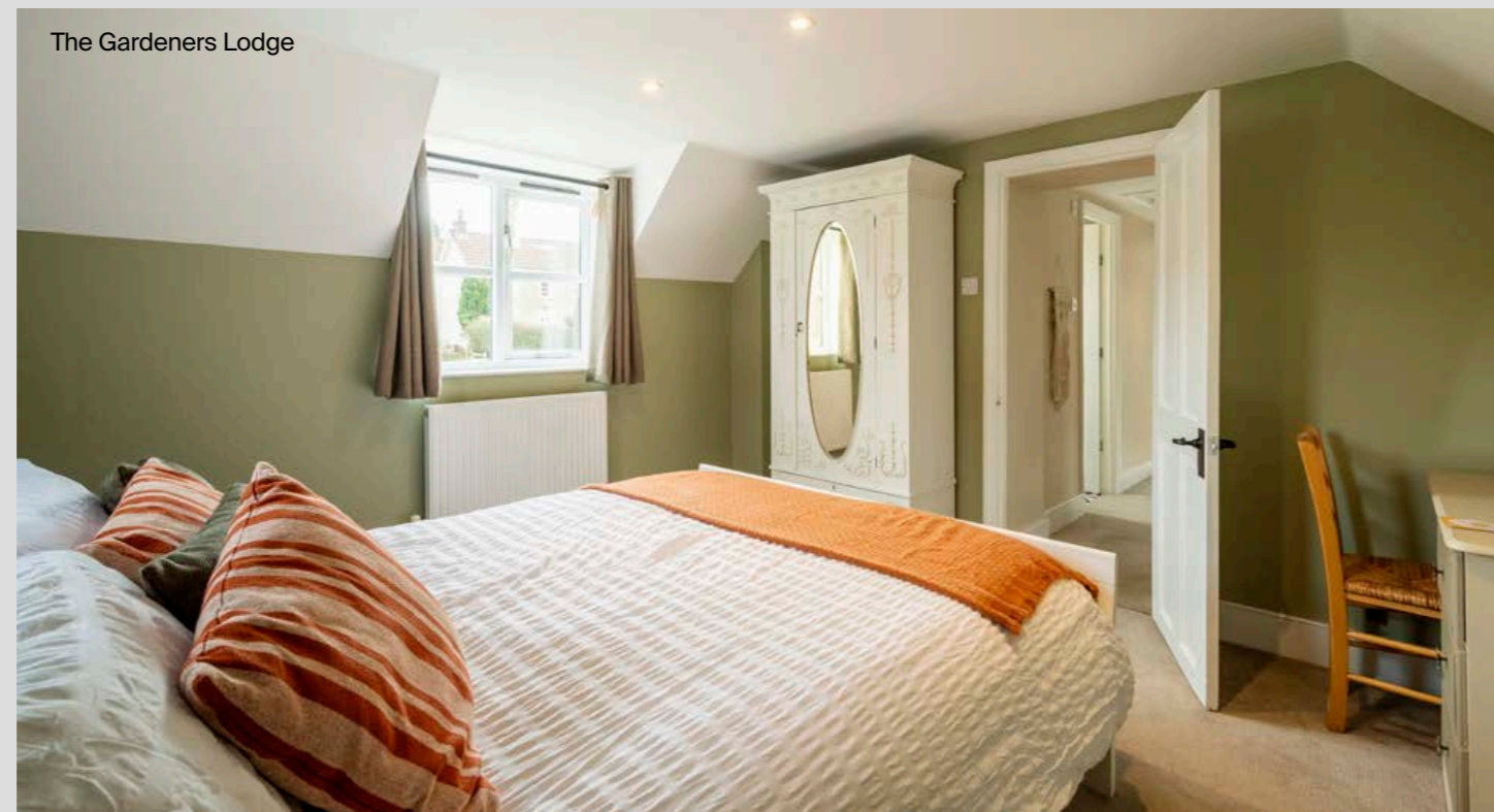
The Gardeners Lodge