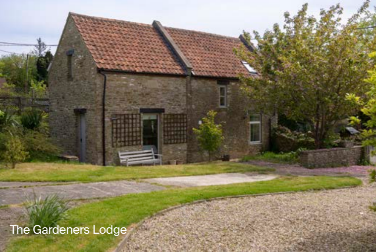
The Gardeners Lodge