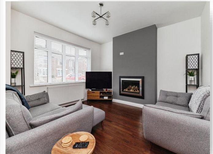
Coniston Grove, Middlesbrough TS5 7DG